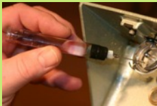
Easy Access "L" size bobbin