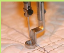
Round Foot for ruler guides