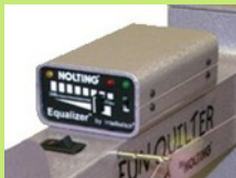
Dual Sided Stitch Regulator