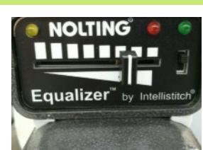
Equalizer Stitch regulator