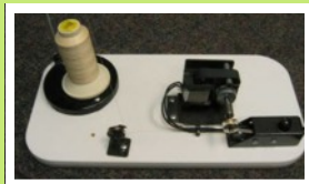
Bobbin winder for either "L" or "M" sized bobbins

The Nolting commercial steel frame. We can deliver the machine and frame to your home and provide setup, testing and training. With the purchase of a full system you get a free bobbin winder, extra bobbins, oil, patterns and a free day of training by our professional quilting trainers. Optional casters and/or hydraulic legs available.