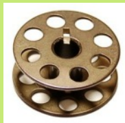
Add "M" sized bobbin and hook assembly for $250.00