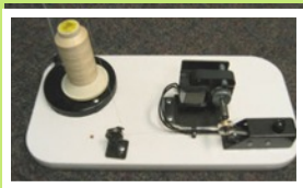
Bobbin winder for both "L" & "M" sized bobbins

The Nolting commercial steel frame. We can deliver the machine and frame to your home and provide setup, testing and training. Along with this you get a free bobbin winder, extra bobbins, oil, patterns and a free day of training by our professional quilting trainers.