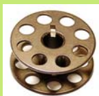
Optional "L or M" bobbin