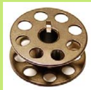
Add "M" sized bobbin and hook assembly for $250.00