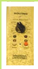
Intellistitch—IS2K Stitch regulator